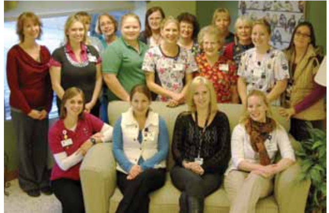
The Augustana Mercy and Mercy Hospital Therapy Team.

To help everything go smoothly, you can pre-plan your stay before surgery. Together we can learn more about your surgery, discuss your rehabilitation or